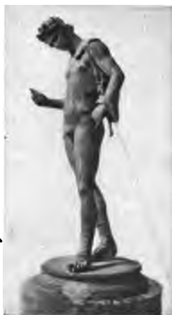
Fig. 49. Youthful Dionysus.

There is much variation in the representations of the god; two distinct types are especially familiar. In the one he appears as a mature man,